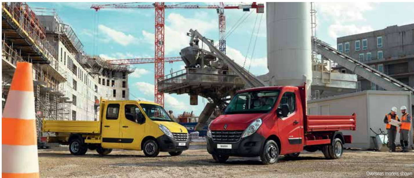
Overseas models shown